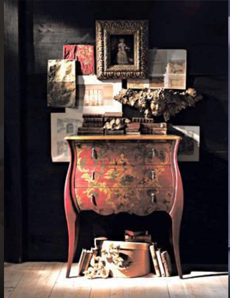
Geisha Bombe Chest, French Heritage